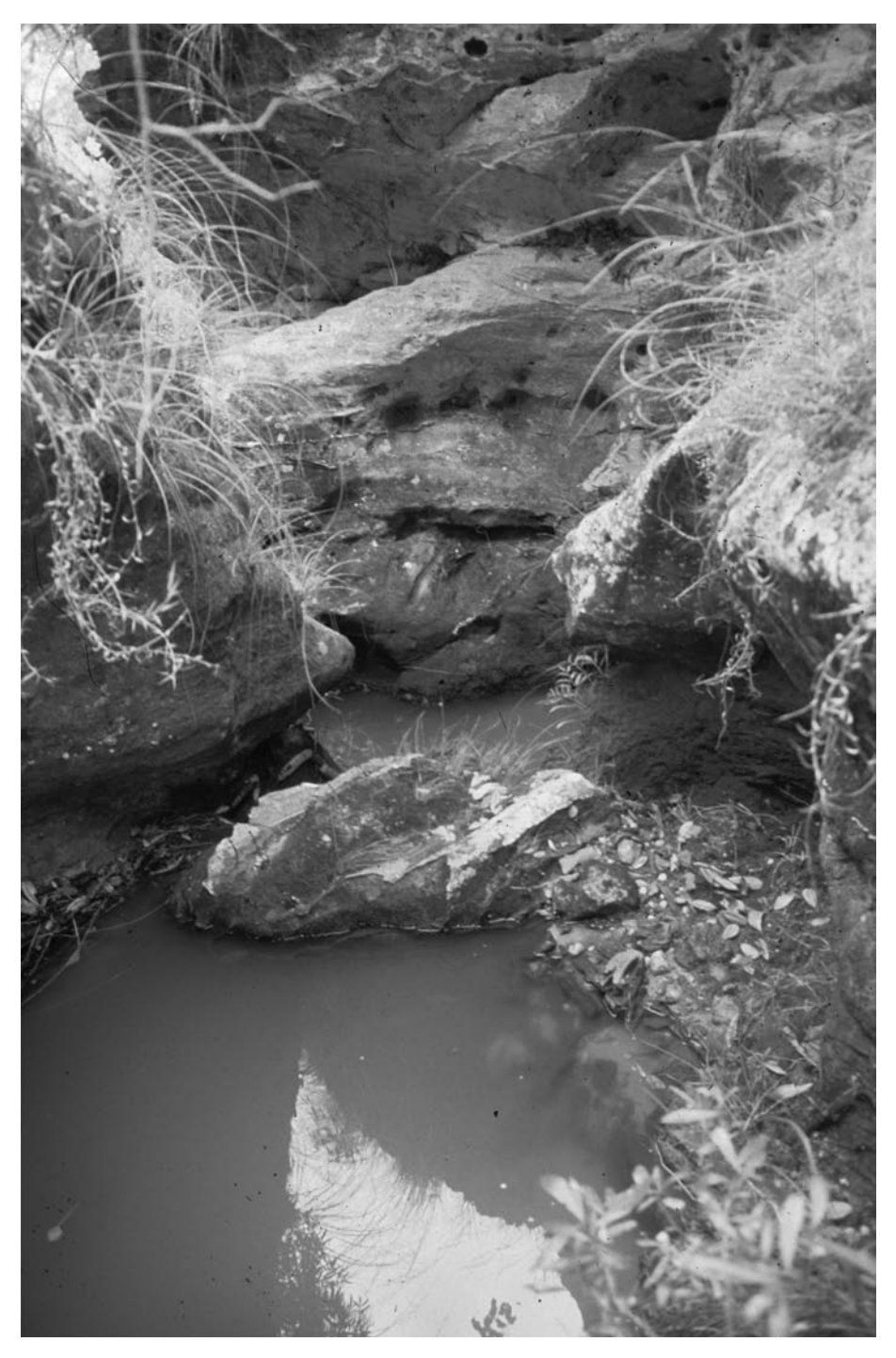
Fig. 6. – Habitat of Scaphiophryne gottlebei at Malaso, Isalo Massif. Gully tract of the canyon, with deep and semi-permanent water pools.