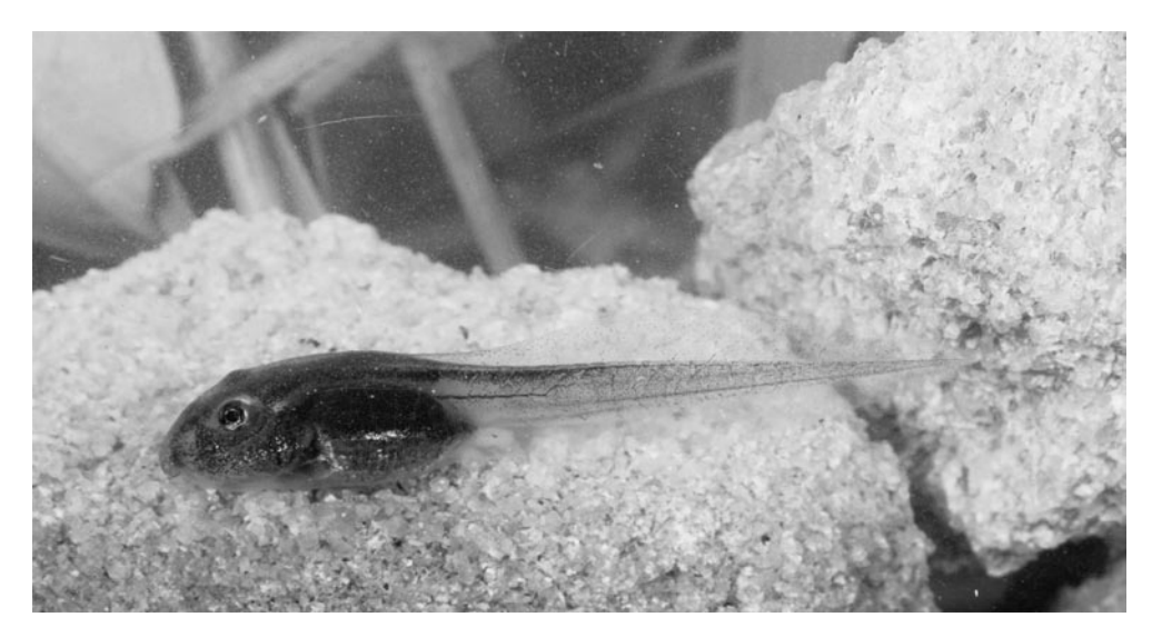
Fig. 4. – Lateral view of a tadpole of Mantella expectata . MRSN A3435, Gosner stage 37 (total length 28.5 mm) from Zahavola 1, Isalo Massif.