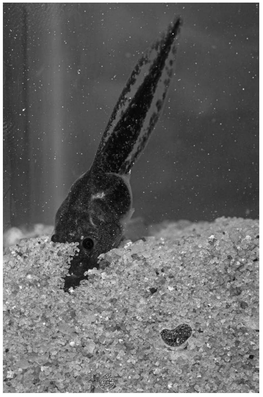
\label{eq:Fig.3.-Tadpole} Fig. \, 3.- Tadpole \, of \, \textit{Scaphiophryne gottlebei} \, \text{half-buried in the sand, a typical position assumed during the day.}