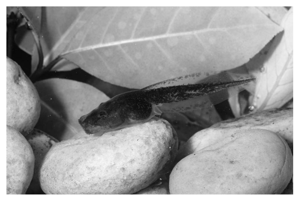
Fig. 1. – Lateral view of a tadpole of Scaphiophryne gottlebei . MRSN A4961, Gosner stage 38 (total length 29.1 mm), from Zahavola, Isalo Massif.