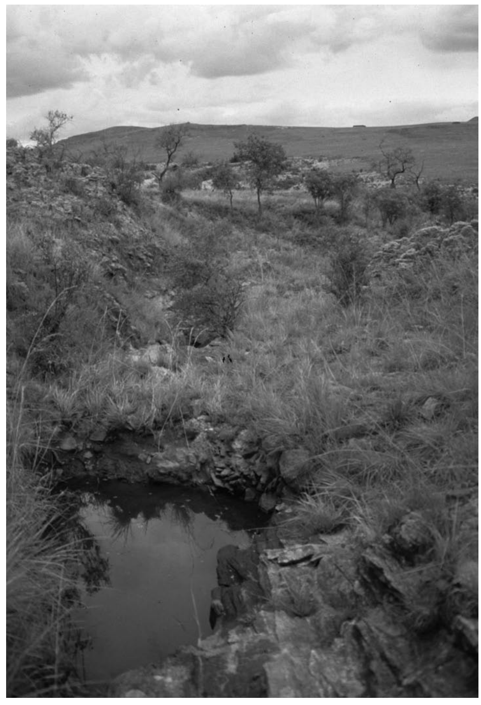
Fig. 7. – Habitat of Mantella expectata at Lola, Isalo Massif. It is represented by a temporary stream at the beginning of the initial tract of the typical montane canyons.